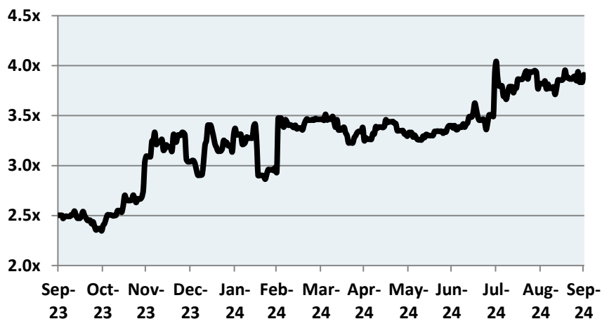
DP Infrastructure Software Index EV/Revenue Multiple Latest Twelve Months