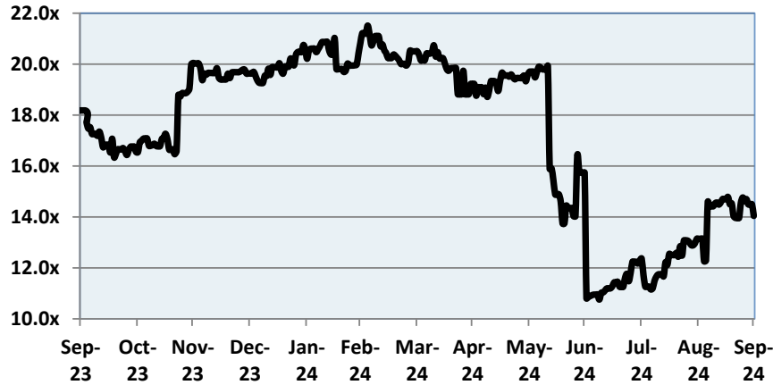
DP Hosted Services Index EV/EBITDA Multiple Latest Twelve Months