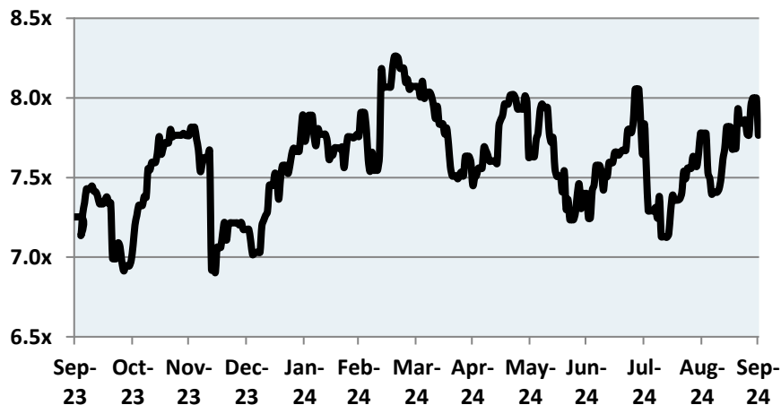
DP Enterprise Software Index EV/Revenue Multiple Latest Twelve Months