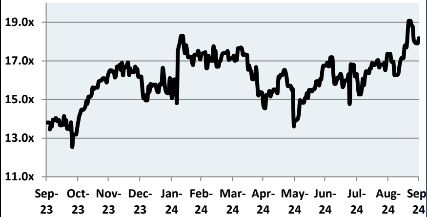
DP AI & ML Index EV/Revenue Multiple Latest Twelve Months