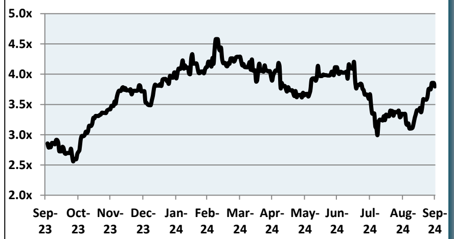
DP Internet Software & Services Index EV/Revenue Multiple Latest Twelve Months