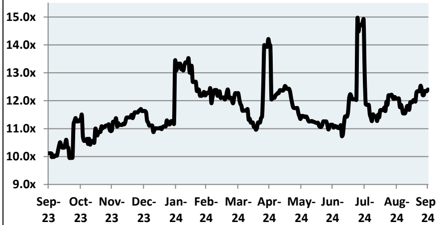
DP IT Staffing Index EV/EBITDA Multiple Latest Twelve Months