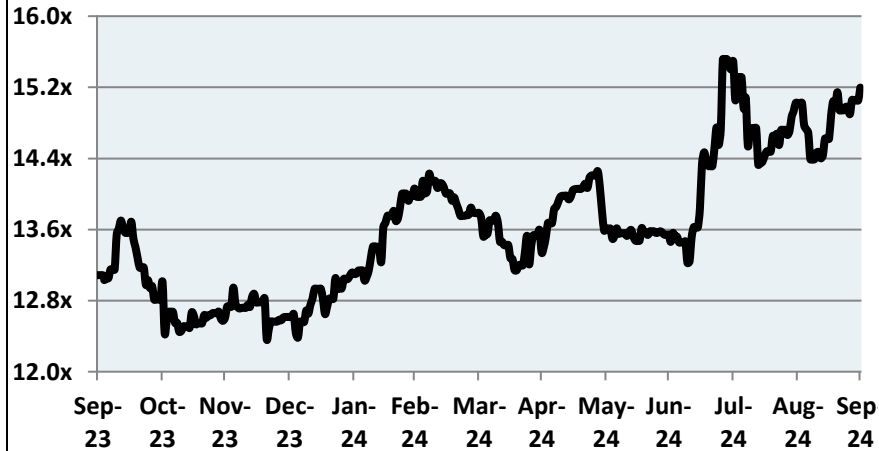
DP IT Services Index EV/EBITDA Multiple Latest Twelve Months