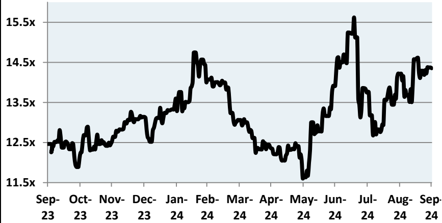
DP IT Outsourcing Index EV/EBITDA Multiple Latest Twelve Months