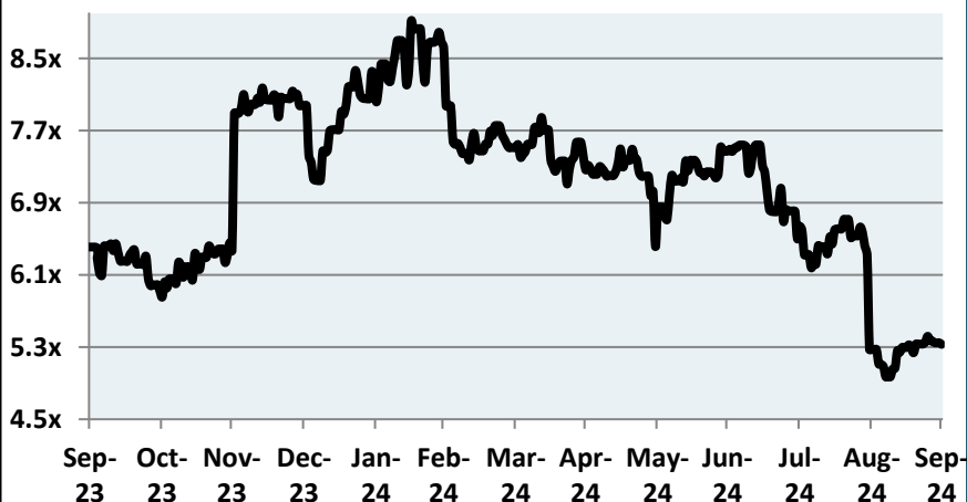
DP BI Software Index EV/Revenue Multiple Latest Twelve Months