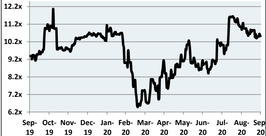
DP IT Staffing Index EV/EBITDA Multiple Latest Twelve Months