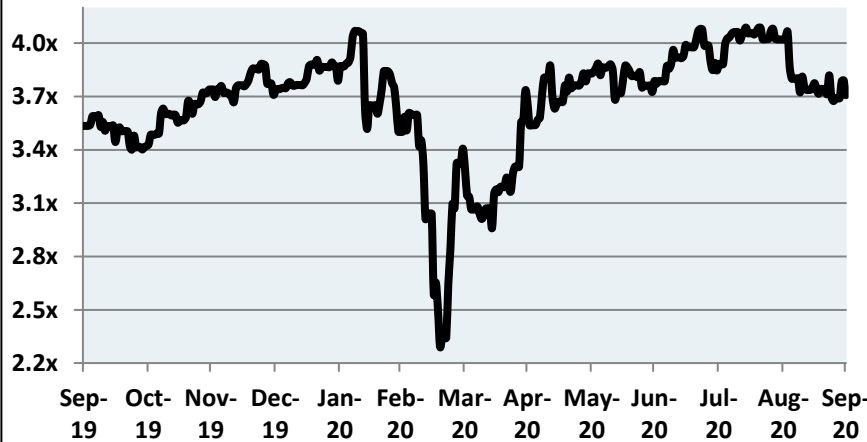
DP Infrastructure Software Index EV/Revenue Multiple Latest Twelve Months