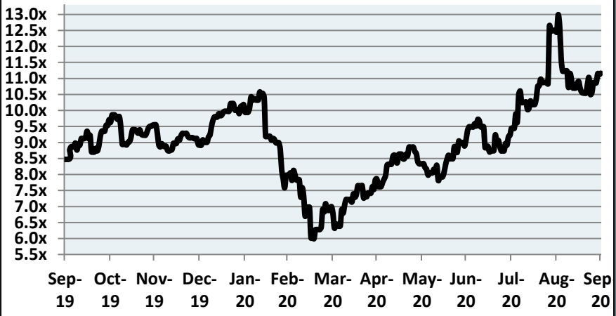
DP SaaS Index EV/Revenue Multiple Latest Twelve Months